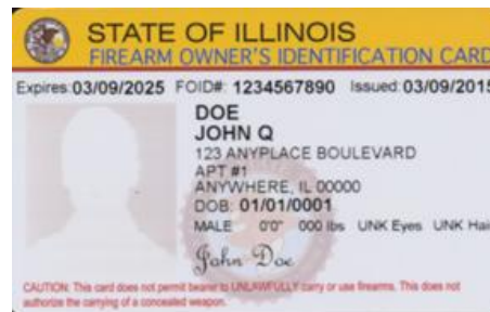
Front of New FOID Card 3/15